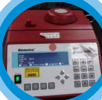
PCR for gene synthesis

For more information on WuXi AppTec's services please contact: