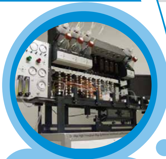
Dr. Oligo 192 DNA Synthesizer For high throughput oligonucleotide synthesis