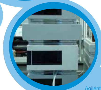
Agilent 1200 HPLC for analysis and small scale purification