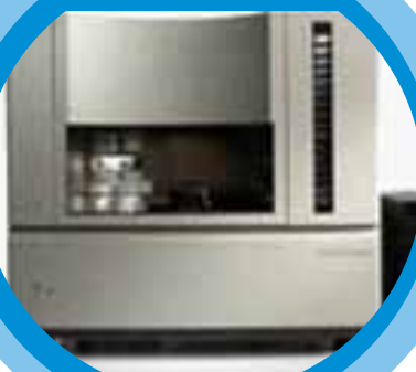
ABI 3730 for Sequencing confirmation

Well organized laboratory operated by experienced scientists and equipped with state-of-art instruments