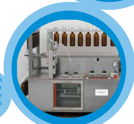
MerMade 6/12 DNA Synthesizer For medium scale oligonucleotide synthesis

For more information on WuXi AppTec's services please contact: